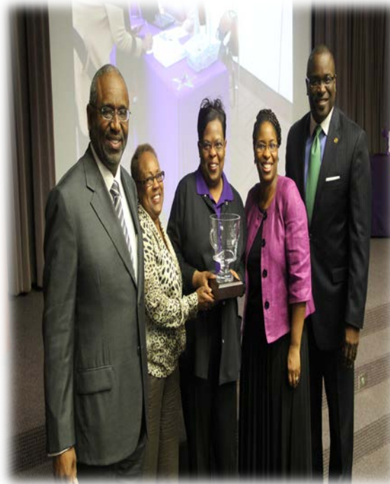
Compliance Champions Owens-Franklin Health Center