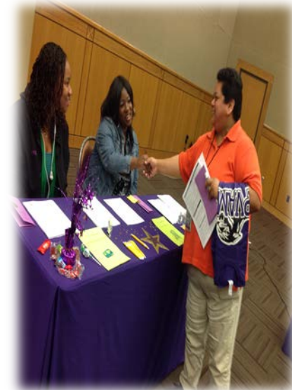
Compliance Week Kick-Off Information Fair