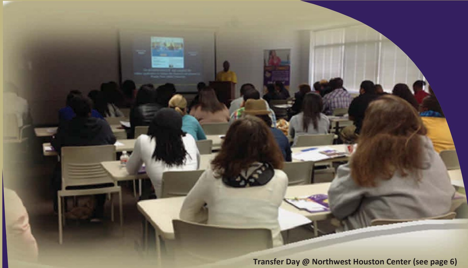
Transfer Day @ Northwest Houston Center (see page 6)