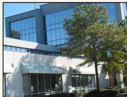
Northwest Campus Northwest Campus Library 2008