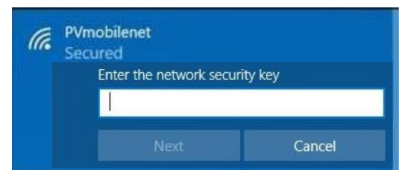
The network security key is: pvamuwifi

Connect to PVmobilenet and enter the network security key.