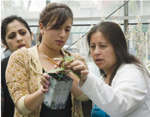
California State University, Los Angeles

59% of FY students at least occasionally spent time with faculty members on activities other than coursework.