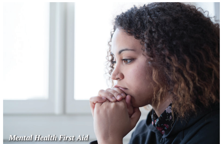
Mental Health First Aid

This year, Prairie View A&M University's Texas Juvenile Crime Prevention Center hosted two Youth Mental Health First Aid trainings to more than 50 teachers, counselors, and school resource officers from surrounding school districts, as well as law enforcement from the Prairie View Police Department and the City of Prairie View. The course is designed to teach parents, family members, caregivers, teachers, school staff, and other individuals that work or engage with teens, ages 12 through 18, who may experience a mental health or addiction challenge and/or crisis. Experienced trainers led the eight-hour course which covered topics including anxiety, depression, substance use, disorders in which psychosis may occur, disruptive behavior disorders (including ADHD), and eating disorders. The course is a much-needed service for adults who work with adolescents, especially with the increased number of school shootings, suicides, and opioid use and abuse among our youth, it is imperative that we all become equipped with the necessary tools to intervene and help as first responders. The more we know about mental health and how it manifests itself among young people, the better prepared we are to help them in their times of crisis.