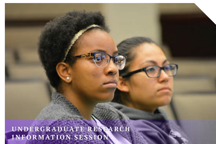
UNDERGRADUATE RESEARCH INFORMATION SESSION