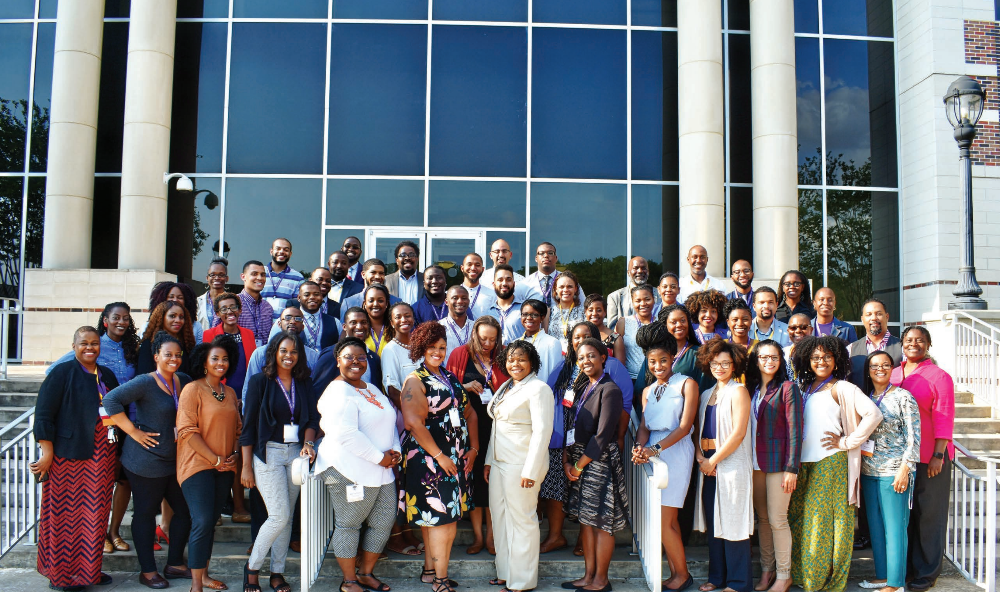
TWENTY-THIRD ANNUAL NATIONAL BLACK GRADUATE CONFERENCE IN PSYCHOLOGY