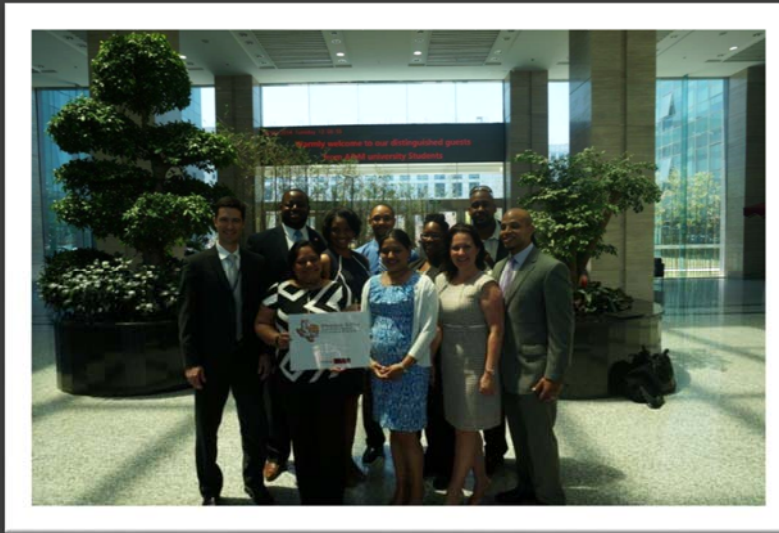
EMBA Students visit Businesses, Travel to Cultural Sites