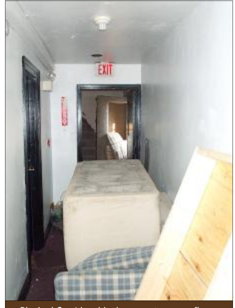
Blocked Corridors block access to upper floors

not make access to the second or third floor corridors due to the amount of furniture and junk stored in the halls. The fraternity brothers were in the process of moving to their new rooms this weekend, and anything left behind was pushed into the hall and left there to be removed at a future time. This morning though they did not expect the