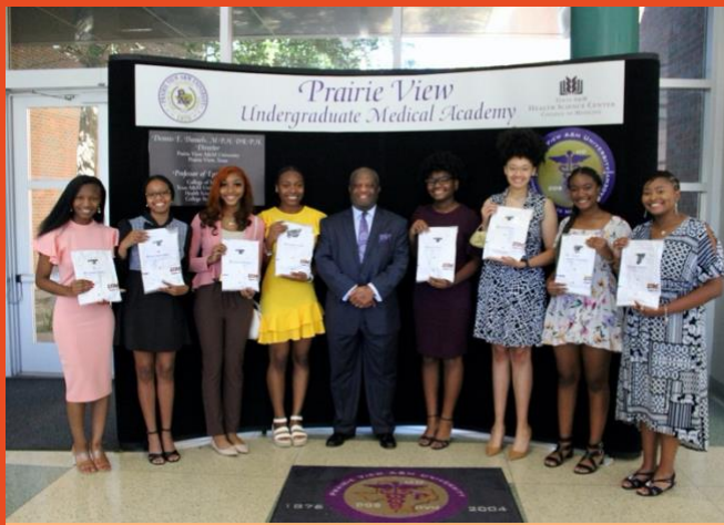
Jasper Class for the 2021-2022 school year