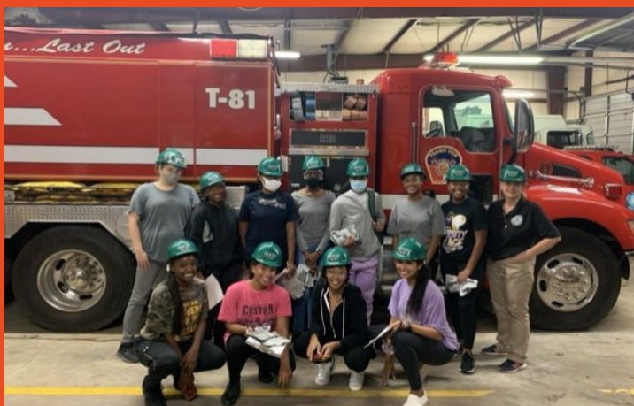
UMA students pose in front of a firetruck at the Prairie View Volunteer Fire Department

The FEMA Community Emergency Response Team (CERT) program was started to train pre-first responders to handle emergencies in their neighborhoods. The Prairie View A&M University Undergraduate Medical Academy CERT team is currently training more CERT members to respond to emergencies in their communities. The PVAMU UMA CERT team recently trained in fire suppression with the Prairie View Fire Department.