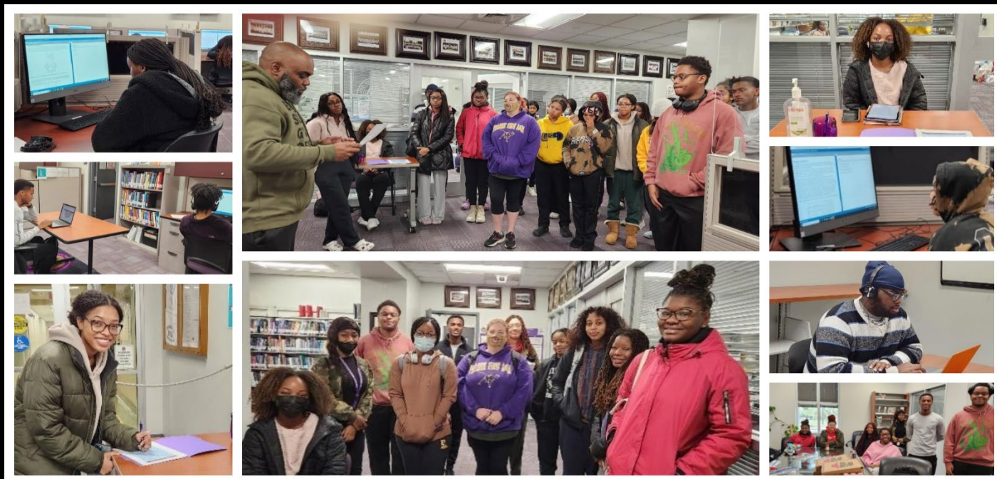
UMA students during the practice MCAT/DAT session on March 4th, 2023

The Texas Undergraduate Medical Academy hosted two practice MCAT/DAT exam sessions on February 11 th and March 4 th , 2023, for UMA students who are preparing for the MCAT/DAT.