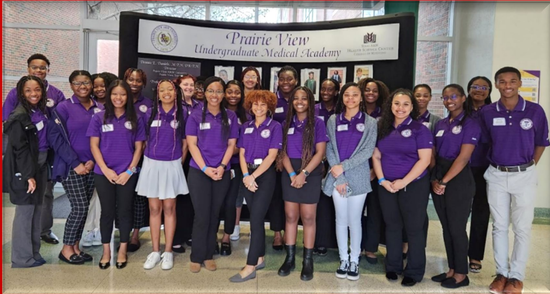
UMA Scholars volunteering during the 2023 Pre-Health Conference

Volume 4 Issue 3 | January/February 2023 | Erin Renfro & Tenley Sablatzky