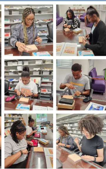
The Suture Lab came back this semester with a bang! Members learned and practiced real surgical suturing techniques using Medical Creation Suturing Kits