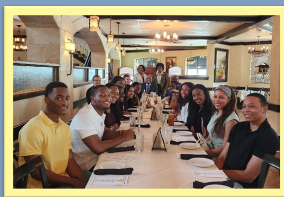
TUMA Senior Upper-Class Affair Luncheon celebrating the students graduating in Spring 2023.