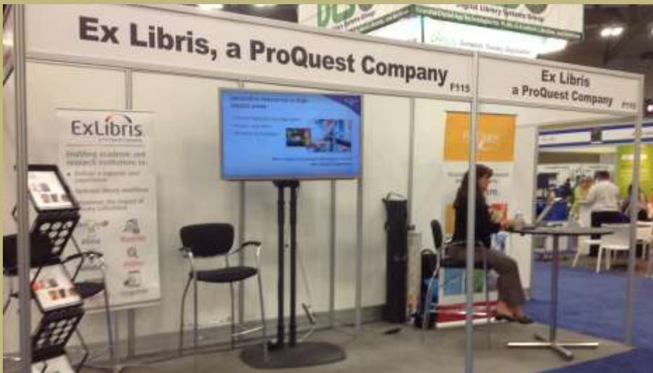
Over 200 Library Vendors