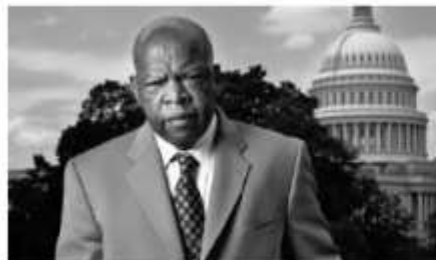
Congressman John Lewis