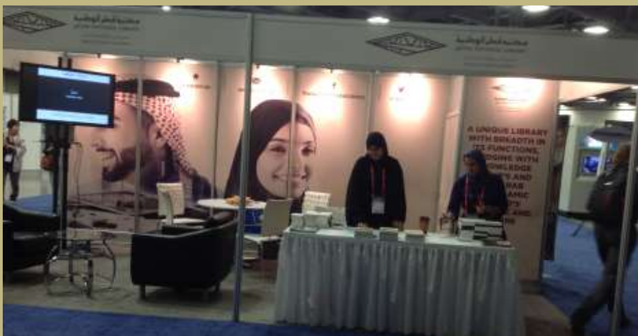
145 Countries from around the world were represented