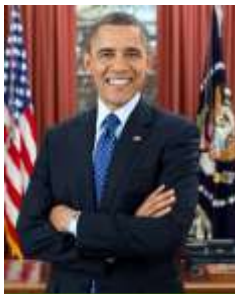
President Barack Obama

简体中文 | Русский | العربية | français | Español | Deutsch