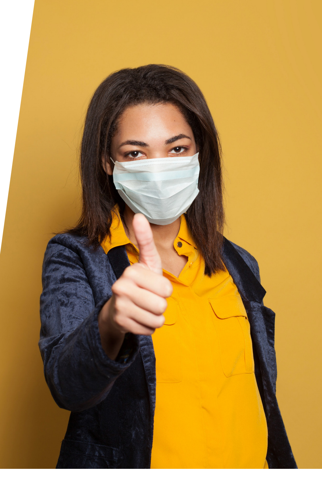
A RETURN-TO-CAMPUS GUIDE FOR FACULTY, STAFF, AND STUDENTS | 5