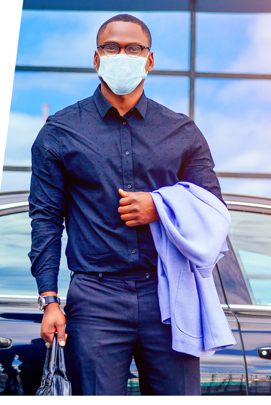
A RETURN-TO-CAMPUS GUIDE FOR FACULTY, STAFF, AND STUDENTS | 21