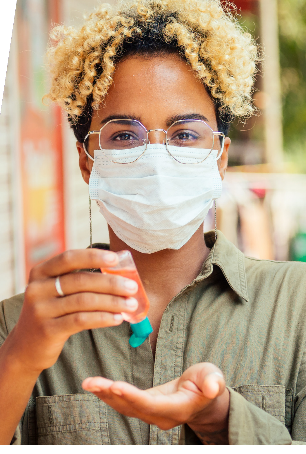
A RETURN-TO-CAMPUS GUIDE FOR FACULTY, STAFF, AND STUDENTS | 27