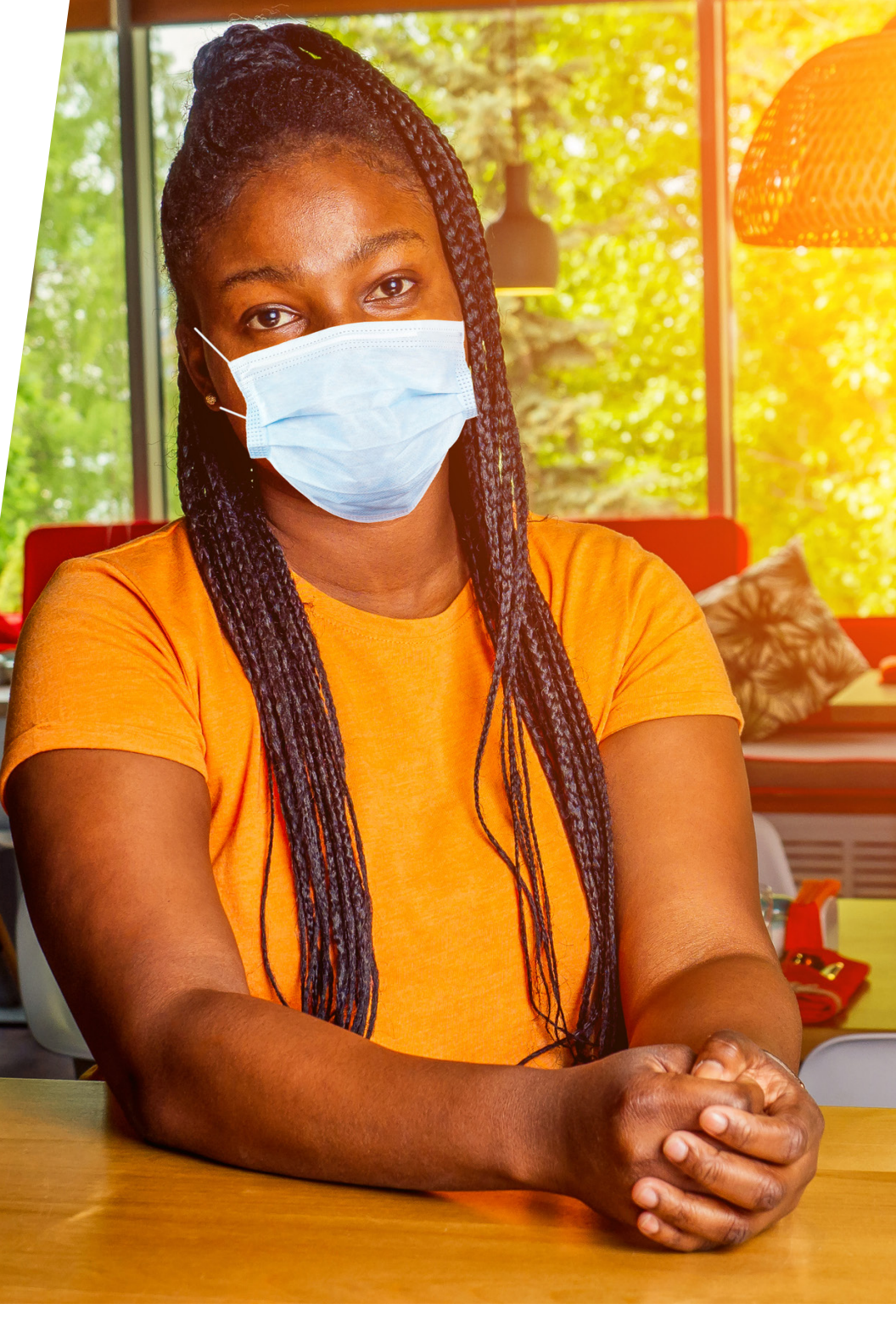
A RETURN-TO-CAMPUS GUIDE FOR FACULTY, STAFF, AND STUDENTS | 15