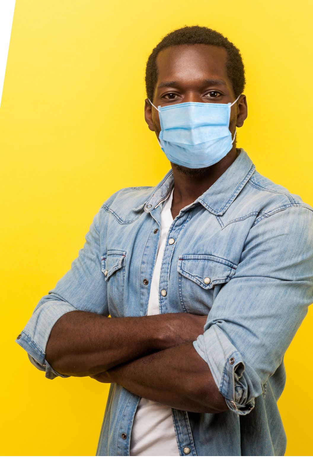
A RETURN-TO-CAMPUS GUIDE FOR FACULTY, STAFF, AND STUDENTS | 3