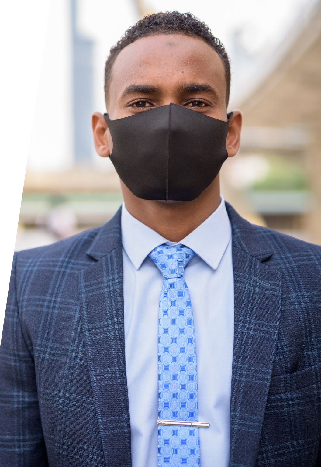
A RETURN-TO-CAMPUS GUIDE FOR FACULTY, STAFF, AND STUDENTS | 13