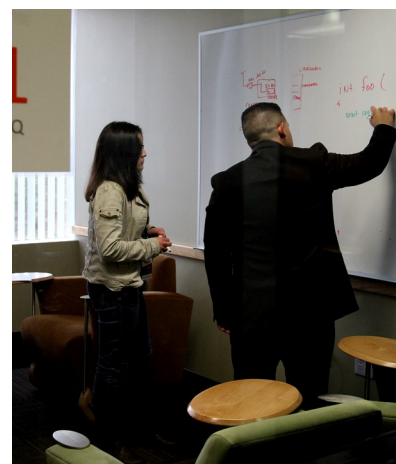
Interview & receive feedback

We're not saying practice makes perfect, but it sure helps when it comes to interviewing (at least with the nerves). With the Accelerator, you will get to practice and complete both a technical in person and phone interview to practice developing your interviewing skills. Our engineers will also provide feedback and tips on how to best articulate your thoughts and approach problems, making it easier to nail the job you want in the future.