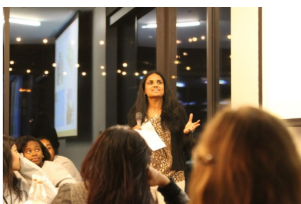
Snapshots from last year's conference