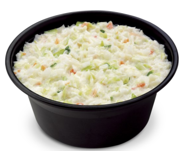
3 cups cabbage pulp 1 1/2 cups carrot pulp 1/4 celery pulp

1 tablespoon white vinegar 3 tablespoons reduced-calorie mayonnaise Parsley sprig for garnish