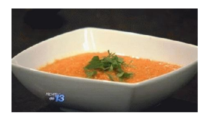
Pulp of 4 large carrots Pulp of 1/4 pineapple saved from Carrot Cake Juice Parsley sprig for garnish

Good for ulcers, lowering blood pressure.