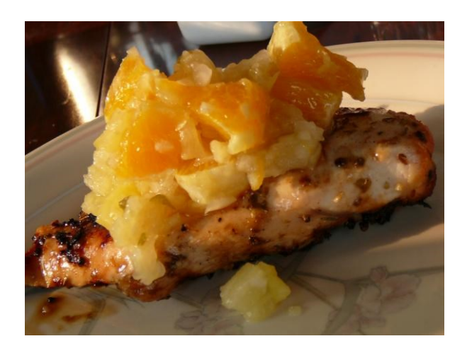
1/2 cup orange pulp