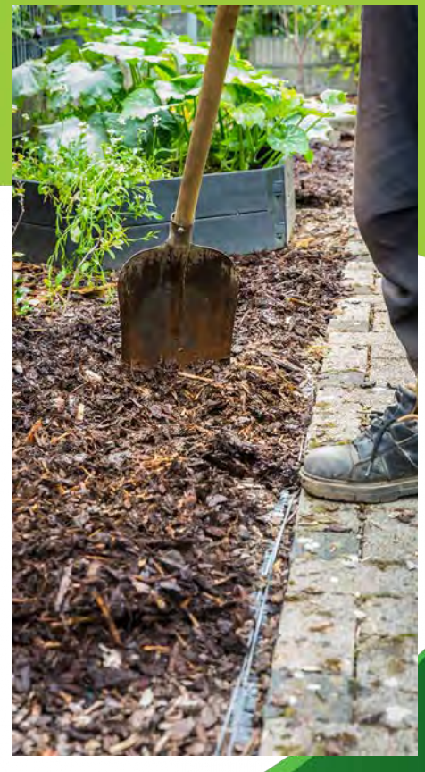
Mulching helps prevent unwanted plants often referred to as weeds.