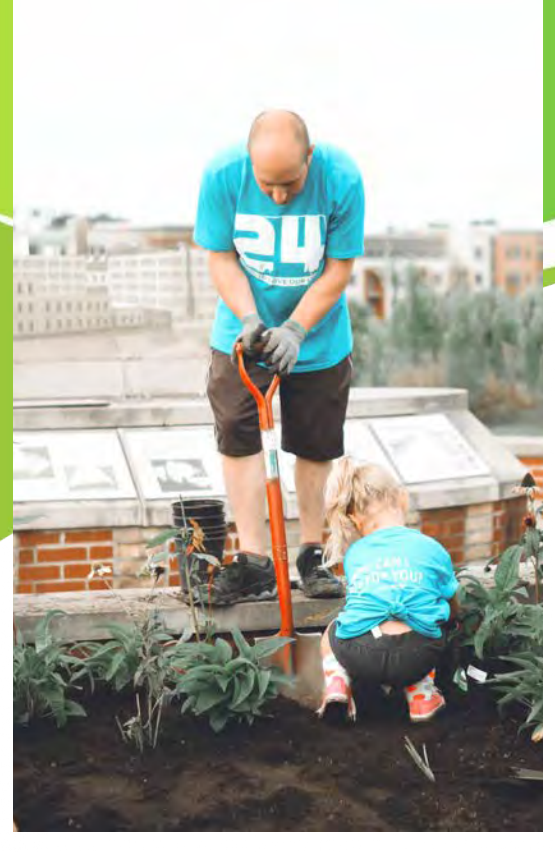
Consider planting disease resistant plants.