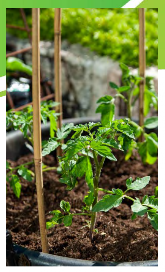
Proper watering, nutrients, and spacing will help protect plants from pests.