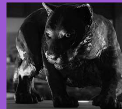
Student Liaison PVAMU COB