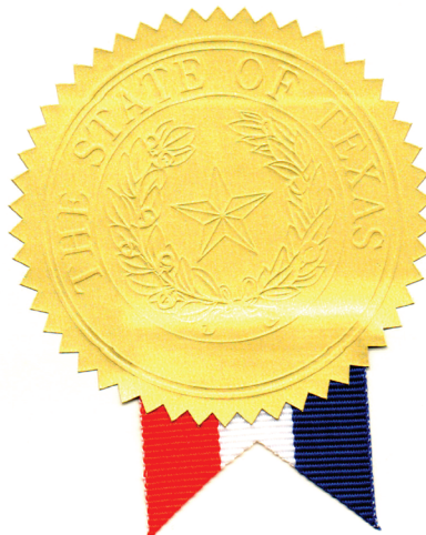
Greg Abbott Governor of Texas

A handwritten signature in black ink that reads "Greg Abbott".