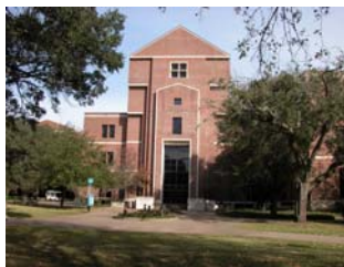
John B. Coleman Library

Question? (936) 261-1535 Askalibrarian@pvamu.edu