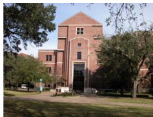
John B. Coleman Library

Question? (936) 261-1535 Askalibrarian@pvamu.edu