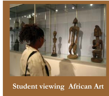
Student viewing African Art

Featured in this collection are several masks, drums, beaded works, furniture, and sculptures. Currently, the majority of this collection consists of art made