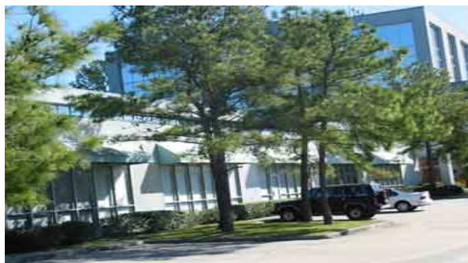
Prairie View A&M University Northwest Houston Academic Center