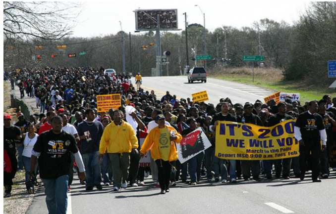
Prairie View Students on the Internet for 2008 election

In February over a thousand students marched 7.3 miles to the county court house in Hempstead to use the two voting machines available for early voting. As evidenced from this Flickr photo and the accompanying You Tube video on the Burnt Orange report website, Prairie View students displayed determination that made national history.