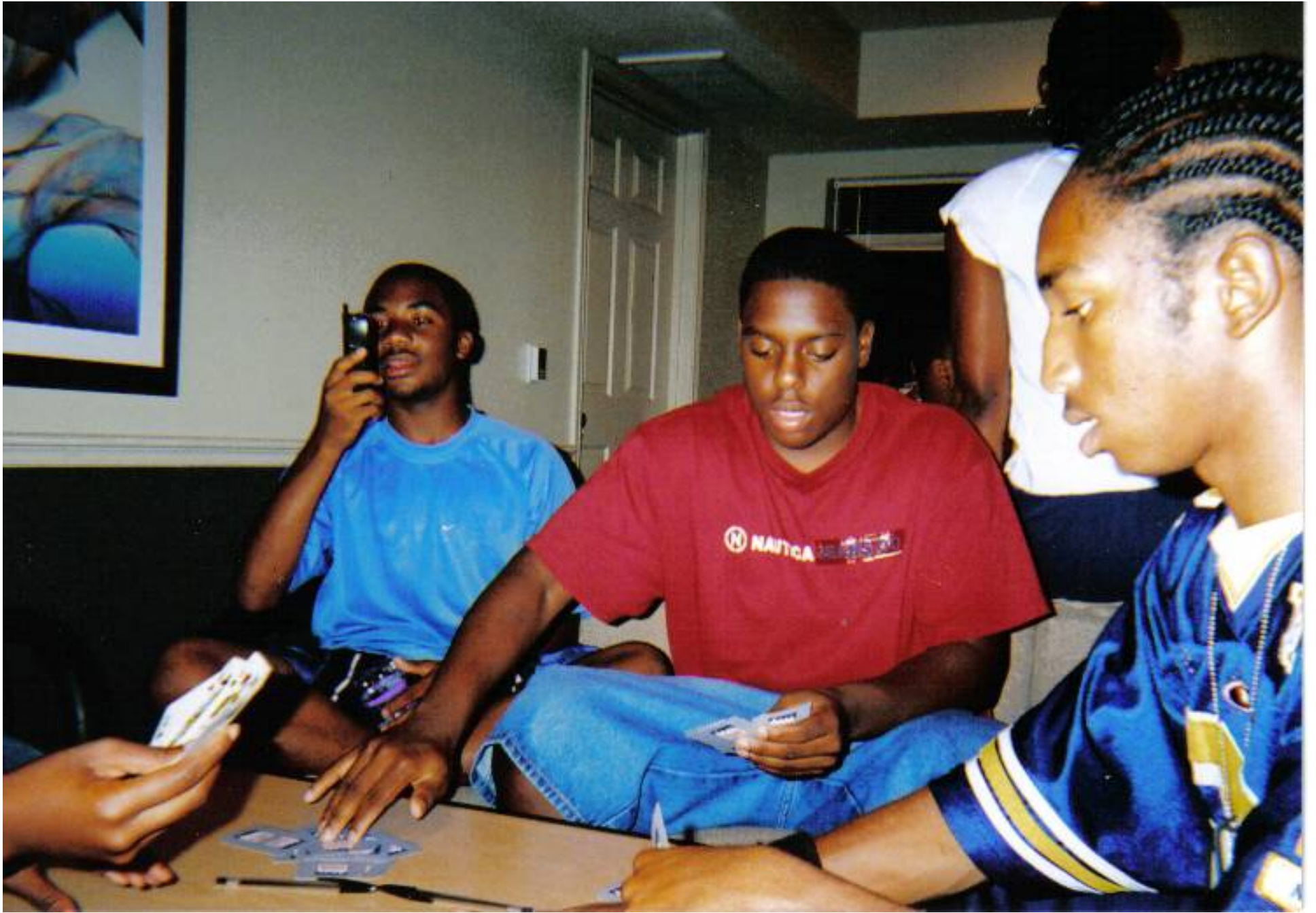
Hang Out In The Dorms