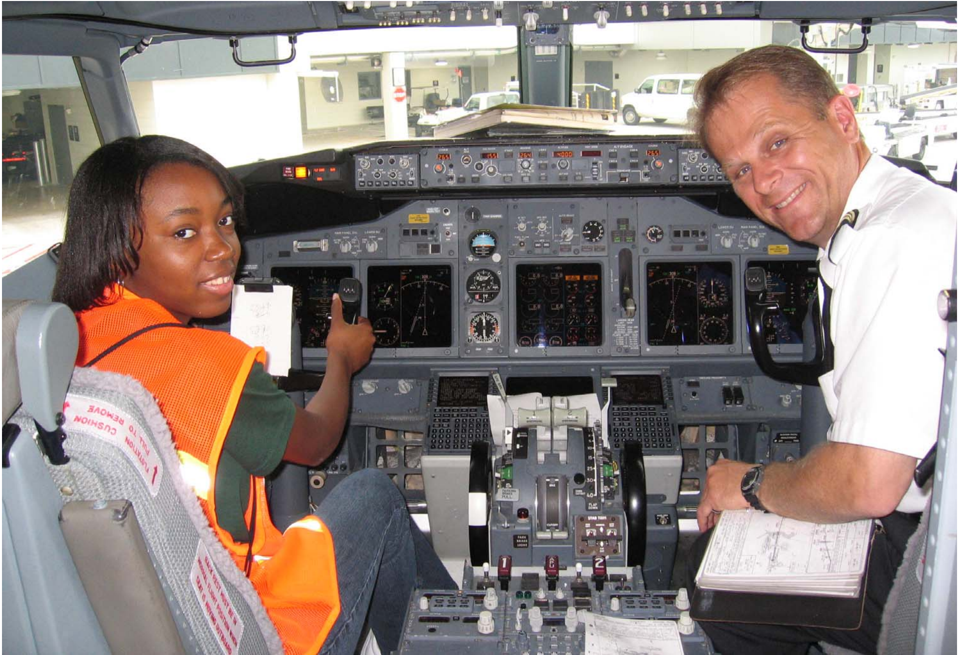
The Bush Intercontinental Airport