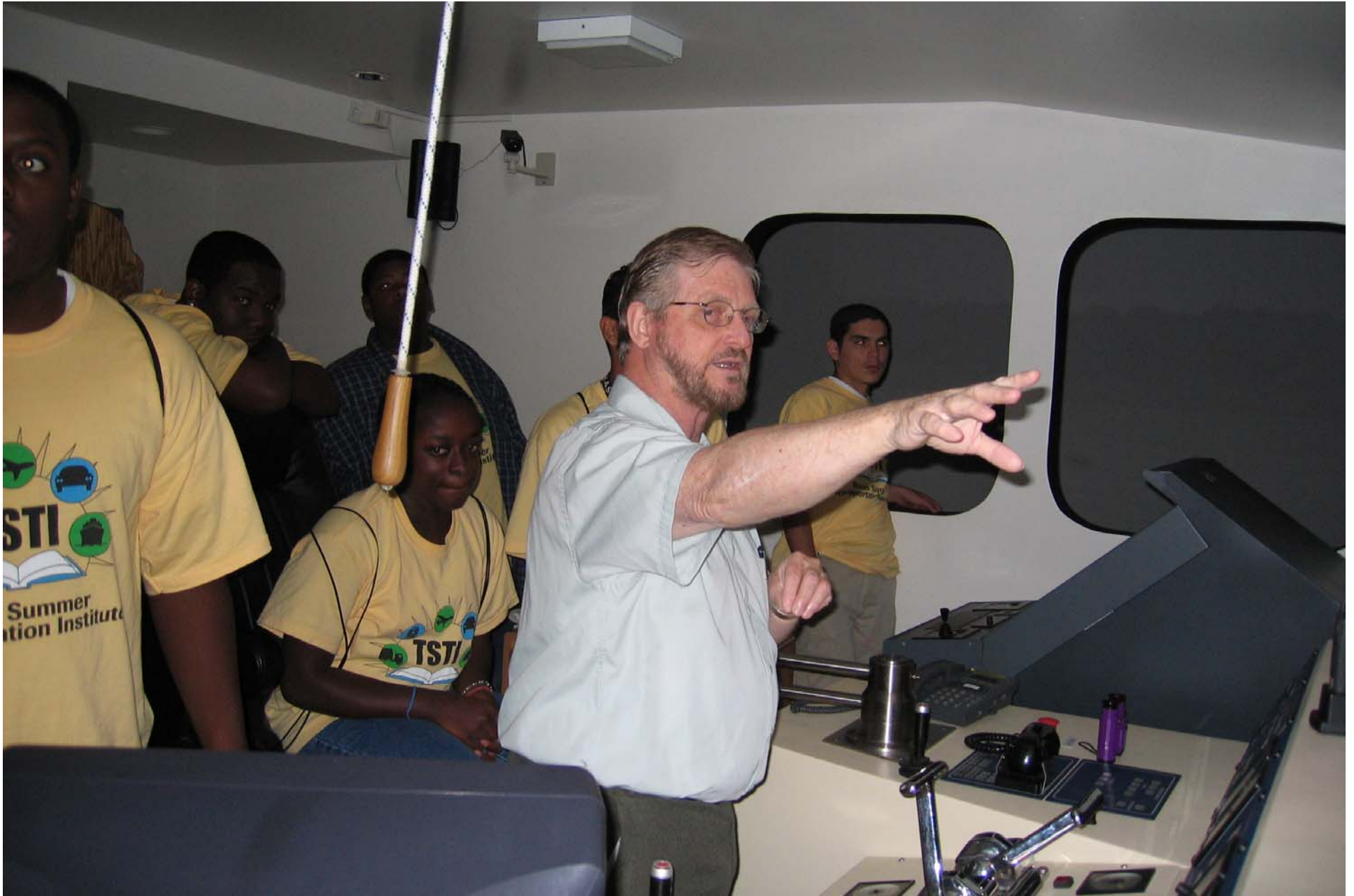
The Ship Simulator