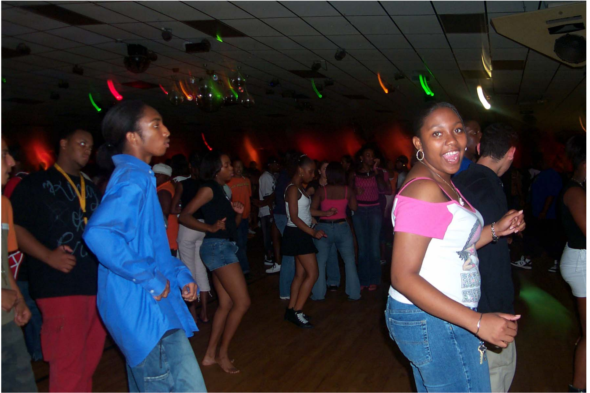
The Skate Rink