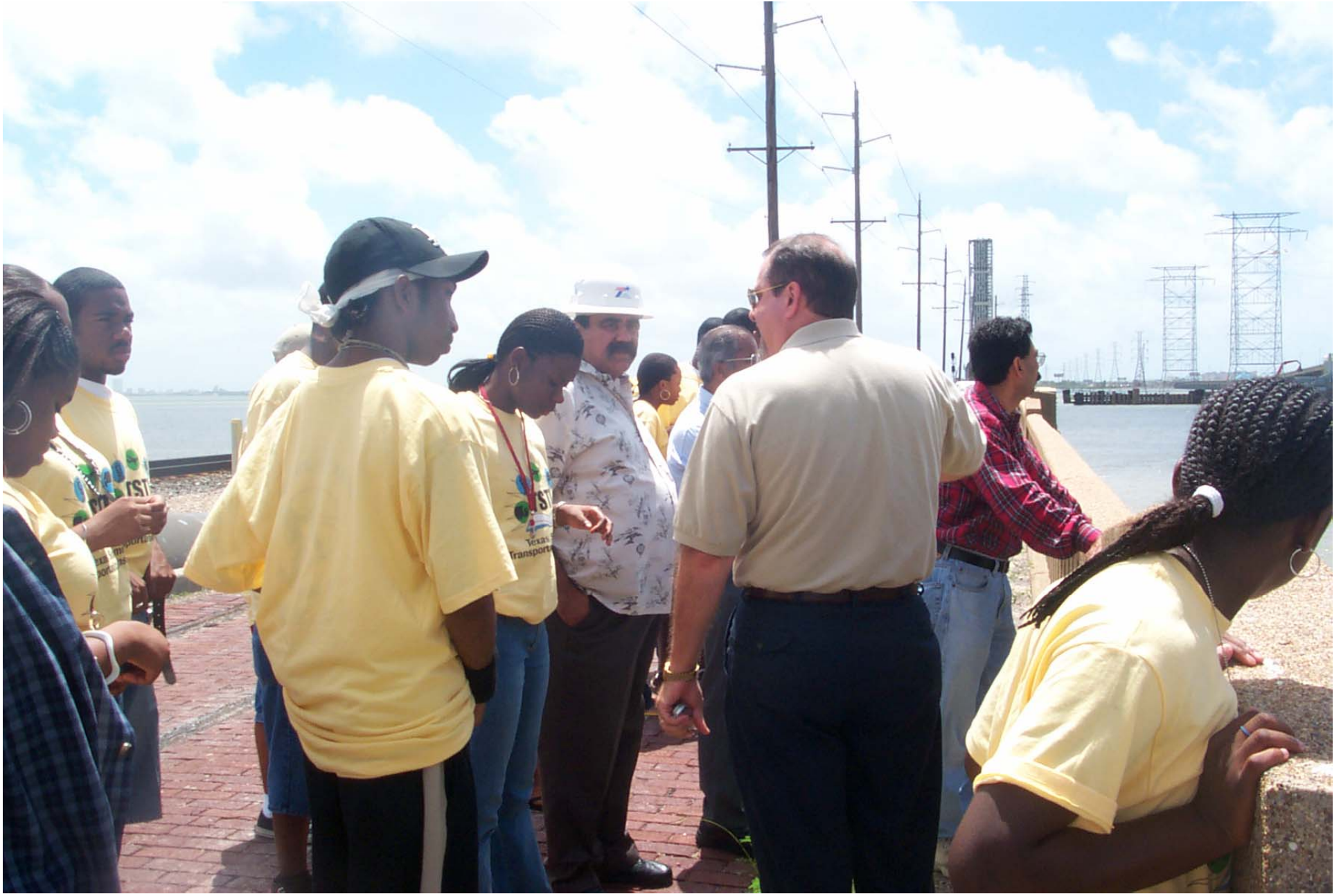
The Galveston Causeway Bridge