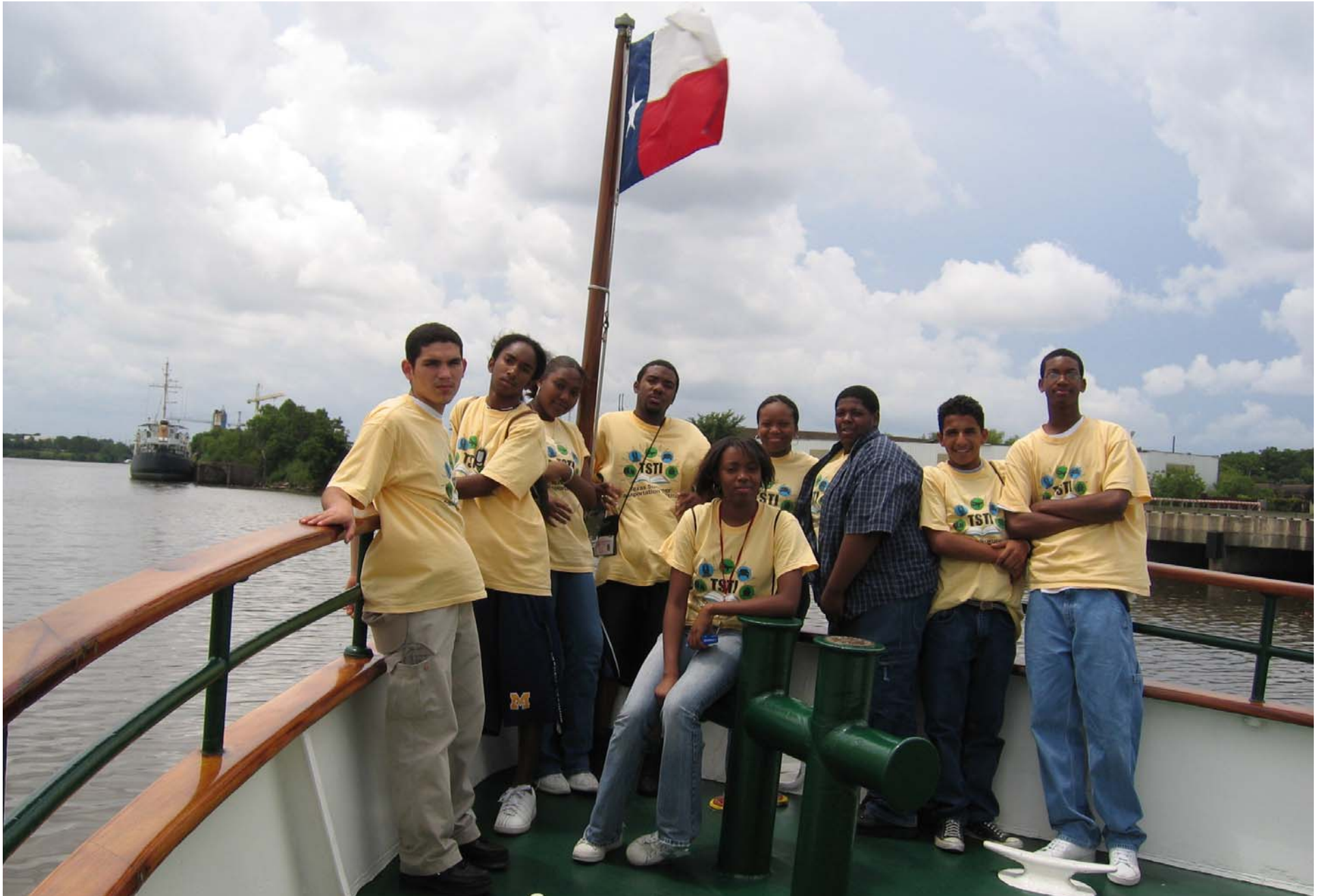
The Sam Houston Boat Ride