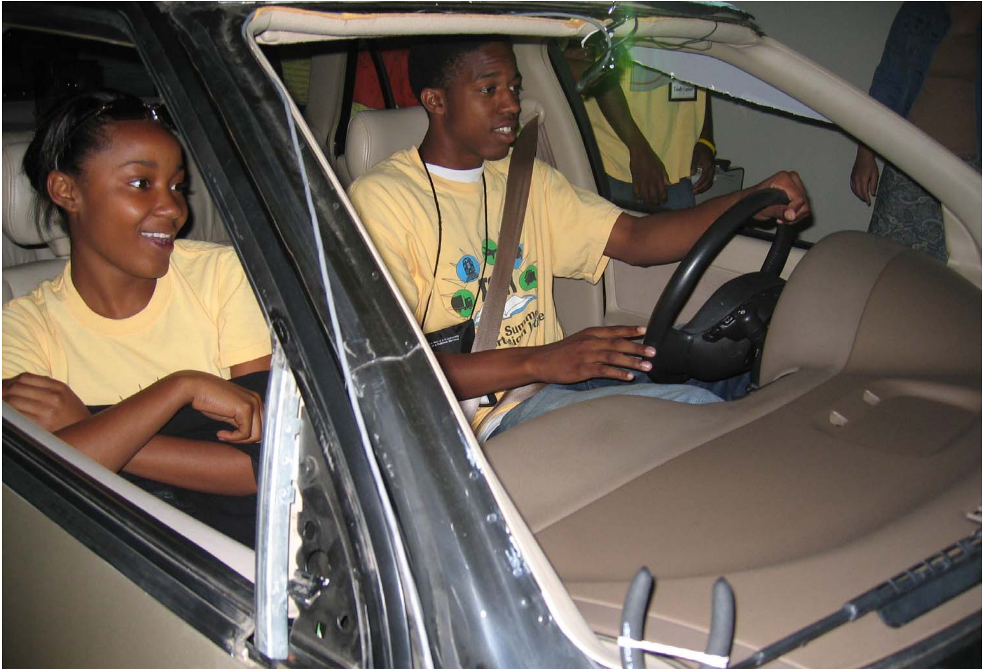
The Car Simulator