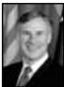
GREG ABBOTT Attorney General of Texas