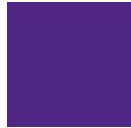
PV Deep Purple Accent Color

(To obtain true PV Purple this color must be printed as a spot color, not in 4-color process)