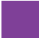
PV Purple Logo Color

Depending on the application, printing process or computer monitor, these colors may appear differently. A spot color (PMS number), CMYK values and web color is given for most colors shown. A spot color is a specially mixed ink using in printing available in many colors and specialty inks such as metallic and fluorescent. Spot colors are pre-mixed and one ink is used for each color in the publication. CMYK (4-color process) creates colors by laying down layers of dots in just 4 specific inks (C is cyan, M is magenta, Y is yellow and K is black). The associated CMYK numbers are the percentage of each color. A web number is the assigned number for web applications.