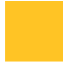
PV Gold Primarily Athletic