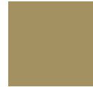
PV Metallic Gold Primarily Academic