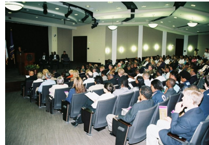
Auditorium Don K. Clark Building College of Juvenile Justice & Psychology