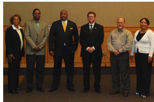
Advisory Board Members at Fall 2008 Meeting.