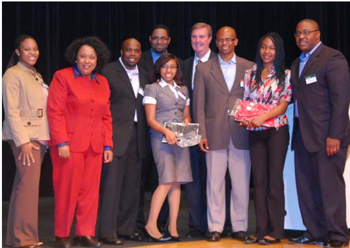
Accenture Team with PVAMU Scholarship Recipients and Administrator.

Nearly 400 students participated in the inaugural Accenture Student Leadership and Development Conference held on the campus of Prairie View A&M University on April 16, 2009. The half-day conference, conceived and coordinated by PVAMU alumni employed with Accenture, was designed to help participants develop the necessary tools and knowledge to become the next generation of corporate leaders.