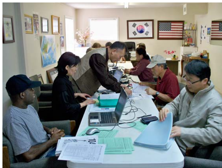
PVAMU Students, Staff, and Faculty assist VITA clients at the Korean-American Association.

In addition to holding twice-weekly preparation sessions at the College of Business, COB VITA held two Saturday sessions at the First Methodist Church in Waller and five