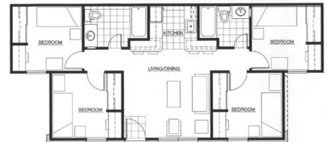
Four Bedroom (Ph. III) 1030 sq. ft. Bed/Bath 4/2