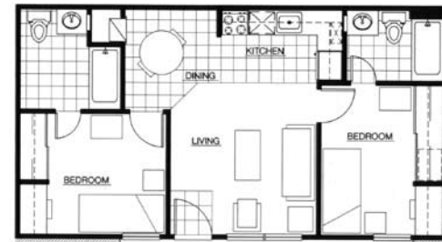
Two Bedroom (Ph. III) 727 sq. ft. Bed/Bath 2/2